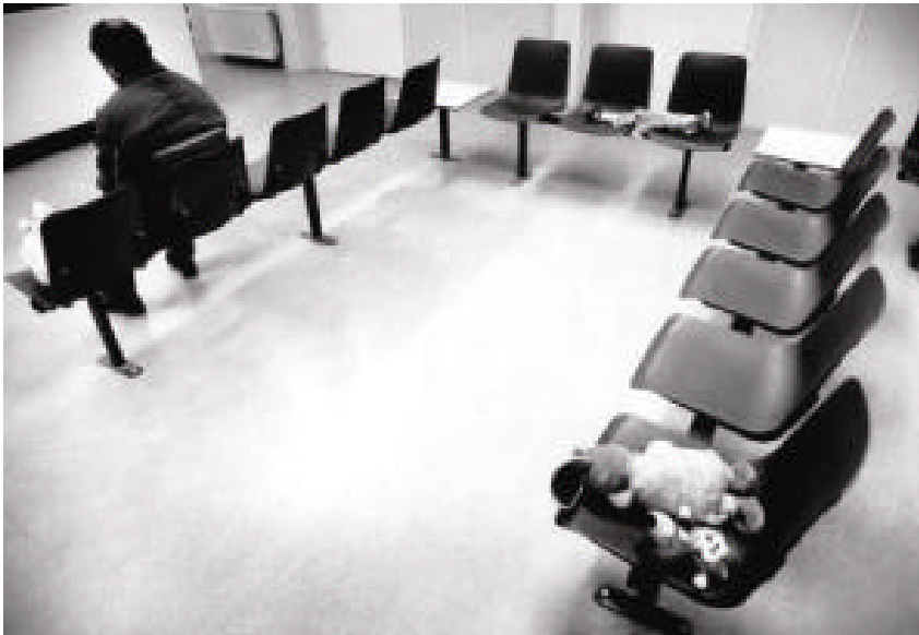
Asylum seeker awaits processing of his asylum claim at the Rijsbergen reception center.

It should be recalled that an applicant for refugee status is normally in a particularly vulnerable situation. He finds himself in an alien environment and may experience serious difficulties, technical and psychological, in submitting his case to the authorities of a foreign country.