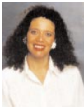
CHERRY SHORT Chair, CRE Wales Committee